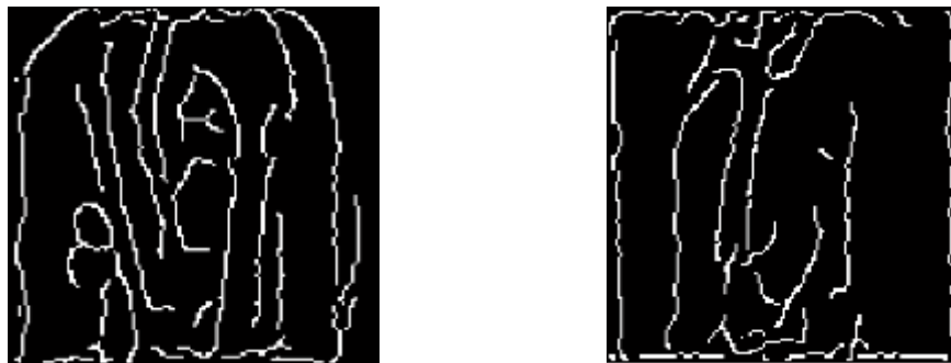
Figure.3, Edge detected vein patterns.